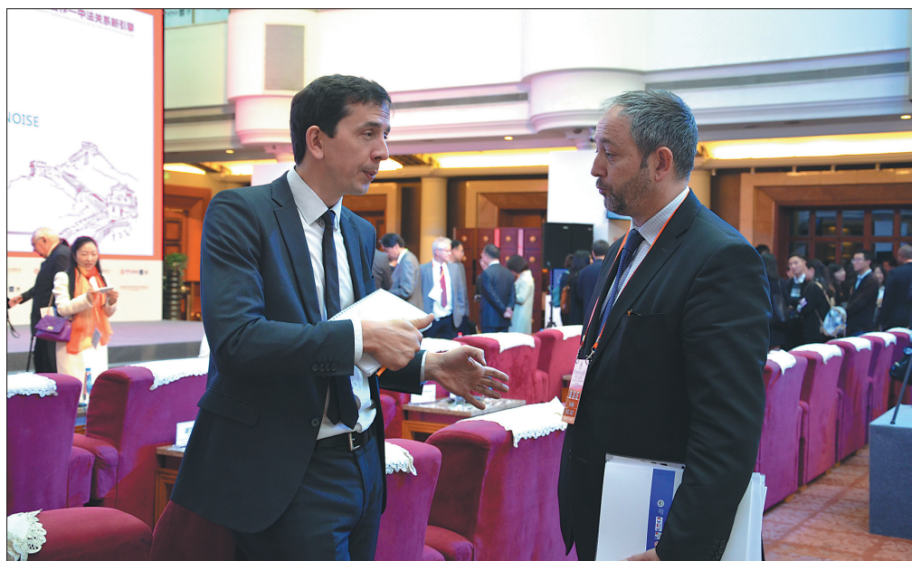
Participants converse at a Sino-French cooperation forum during the 16th Western China International Fair.

A total of 1,008 investment projects worth 787.7 billion