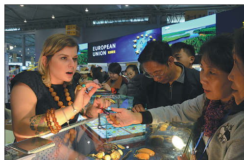
Visitors shop for amber products from Poland.

value of the Chengdu base to reach 100 billion yuan after the projects are put into operation.