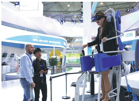
The 16th Western China International Fair in Chengdu enables visitors to see and experience the latest technologies. PHOTOS PROVIDED TO CHINA DAILY