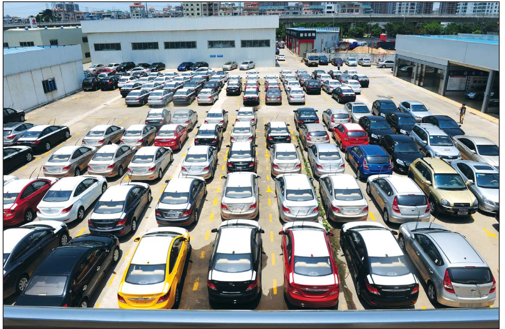
A 4S shop in Haikou, where dealers are seeing low sales and excessive inventory.